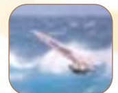
High Performance Video System